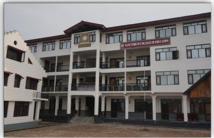
Academic Block 2 nd