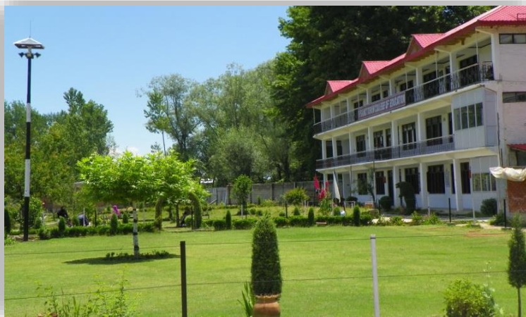
Academic Block 1 st

Nice looking three storied Academic Block Ist and 2nd attached with a single storied Administrative Block besides a separate Hostel Block for Girls. With lush green compounds of 24,878Sft excluding adjacent local sports field for cricket and football upon an area of 9948 SM The entire rooms and lecture theatres are sufficiently furnished with latest furniture and fixture besides fittings for audio visuals and Heating Appliances etc.