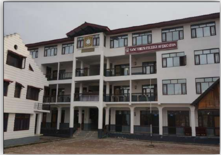
Academic Block 1 st